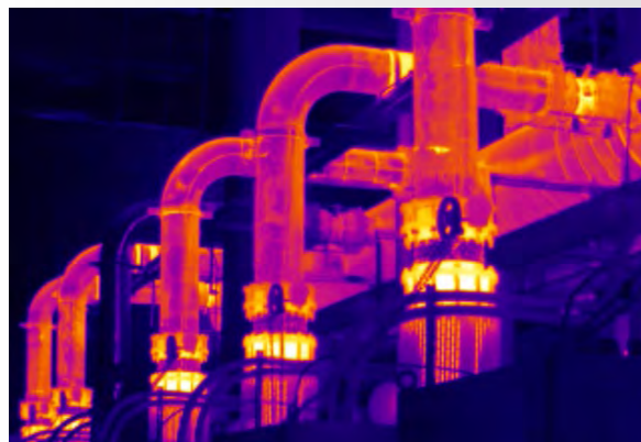
MultiSharp Focus, available on the RSE300 and RSE600 Infrared Cameras