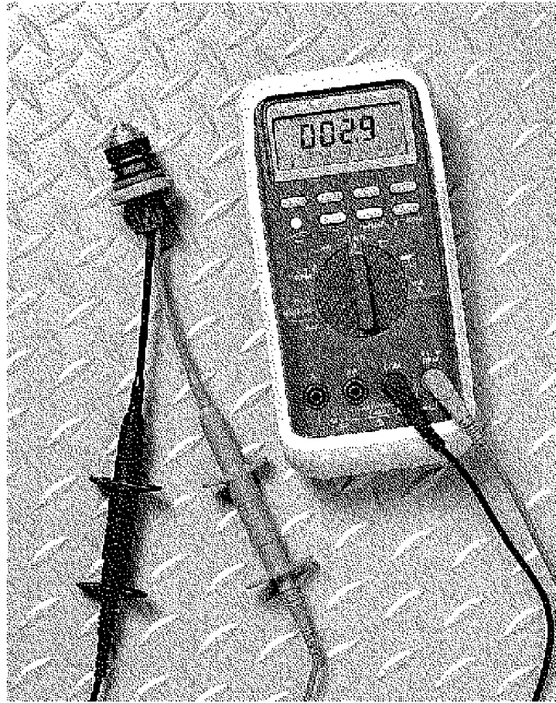
Figure 1. Normal fuel injector measurement

The Fluke 88 has a feature called Zero . This powerful function will automatically subtract one reading from another, such as the instrument's test lead resistance from all future measurements. The results are more accurate and reliable.