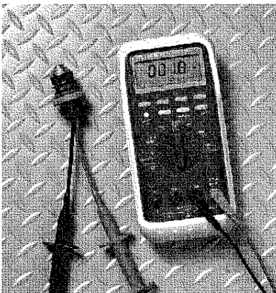
Figure 3. Fuel injector resistance with zero function

With the ZERO function engaged, measure the fuel injector again. Note that the actual resistance of this fuel injector is within specs at 1.8 \Omega (Figure 3).