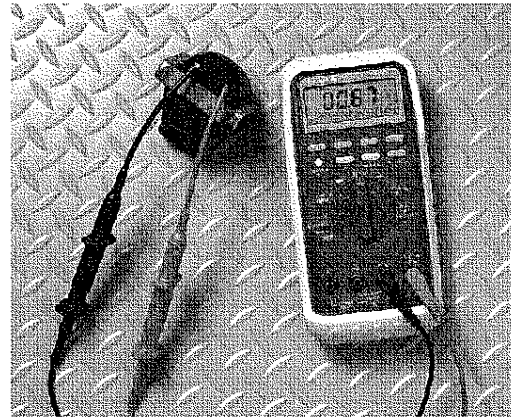
Figure 5. Ignition coil primary resistance

This feature is valuable when measuring very low resistances, such as the ignition coil in Figure 5. The specifications for this coil are .5 \Omega to .9 \Omega . If you were to unknowingly add the test lead resistance (.89 \Omega ) to the actual coil resistance, you would have incorrectly identified a coil pack with excessive resistance in the primary.