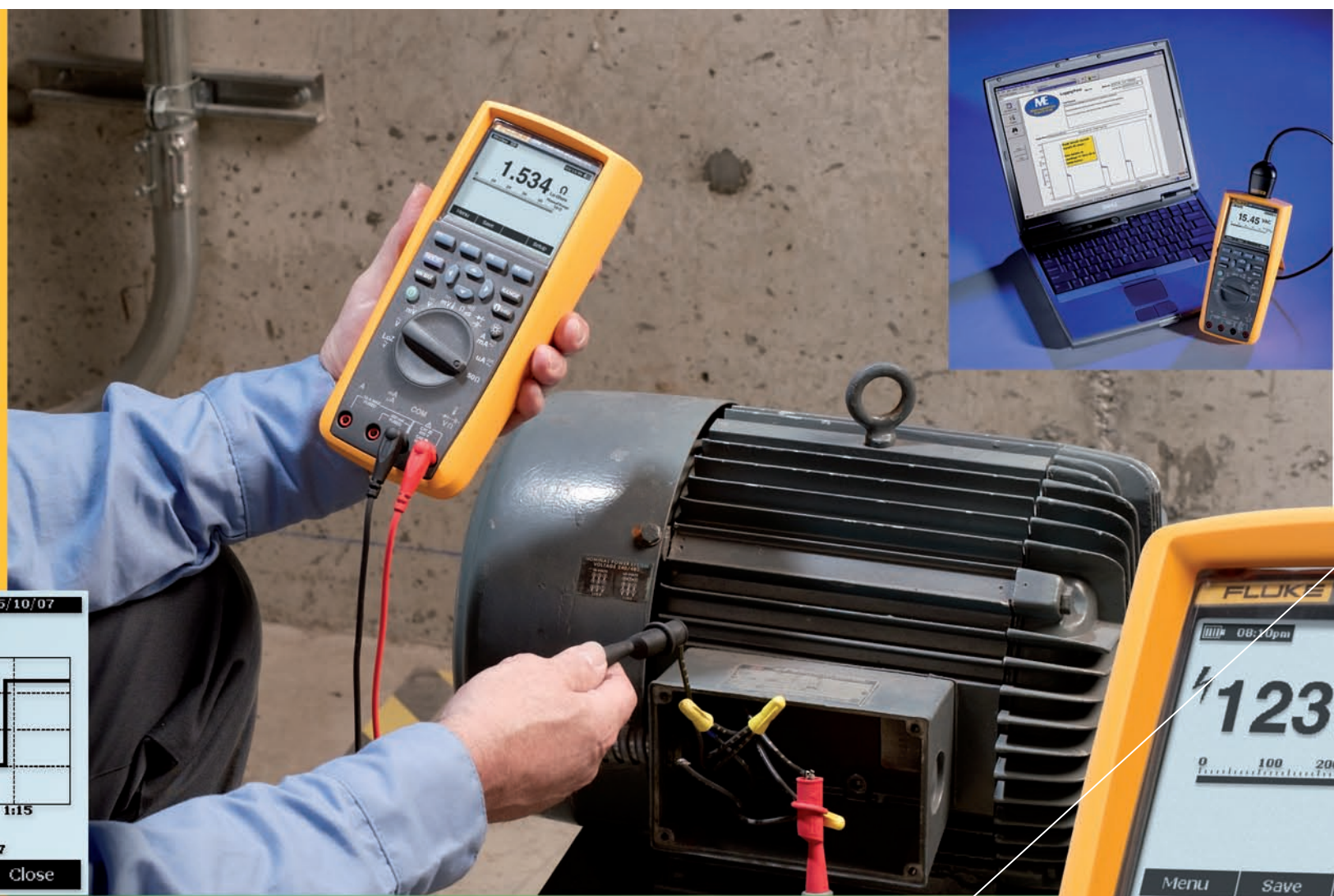
Transfer data to PC using optional cable and FlukeView Forms Software