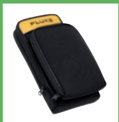
C781 Soft Meter Case