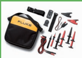
TLK289 Electronic Test Lead Kit