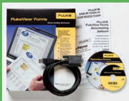
FlukeView® Forms Software and Cable

A wide array of accessories is available to help you maximize the productivity of the Fluke 289 but the following are essential for most users.