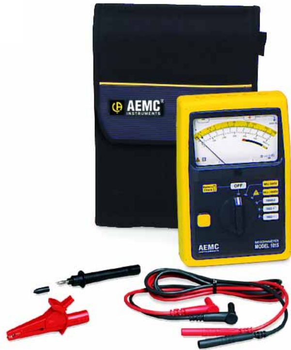
Model 1015 includes carrying case, shockproof rubber housing, two color-coded leads, red insulated alligator clip, black test probe, spare fuse, batteries and user manual